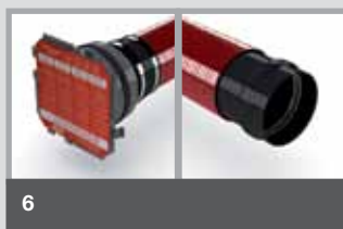
KB / SM First side with packing for encasing in concrete. Second side with connecting sleeve for the connection of a smooth-walled pipe.