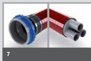
D / Dx First side for the connection to a packing. Second side with system cover for the sealing of pipes with heat shrink technology.