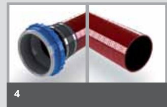
D / 0 First side for the connection to a packing. Second side without connection element (subsequent installation is possible).