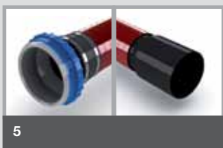
D / KM First side for the connection to a packing. Second side with bonded socket joint for the connection of a pipe.