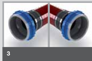
D2 Both sides for the connection of a packing.