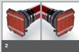
KB2 Both sides with packing for encasing in concrete.