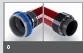
D / GPD First side for the connection to a packing. Second side with GPD rubber-press-seal for the connection to a core hole or casing tube.